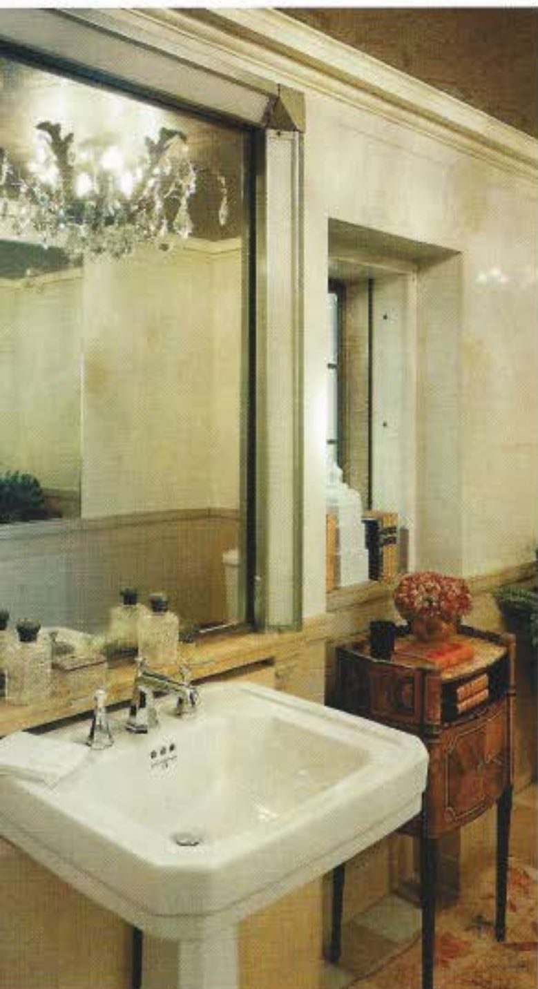
Ladies Lounge powder bathroom designed by Luxe Interiors + Design.