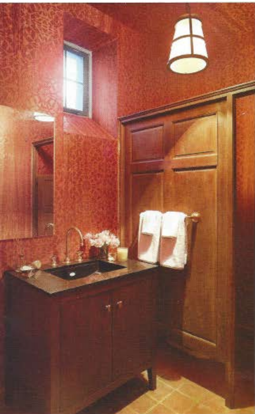
Lower-level powder room designed by Luxe Interiors + Design.

FEMME SUITE SPONSORS: Farrow & Ball: Walls in Savage Ground No. 213 in Estate Emulsion and trim touch-up in New White No. 59 in Estate Eggshell. Samad: Rug. POWDER ROOM SPONSORS: Arte through Egg & Dart: Wallcovering. Kallista through Snyder Diamond: Vanity, wall cabinet. Lanterna Masters: Lighting. Rohi through Snyder Diamond: Michael Berman faucet and towel bar.